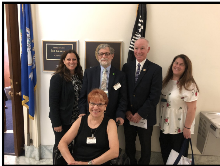
The Connecticut Annual Leadership Meeting delegation met with U.S. Representative Joe Courtney